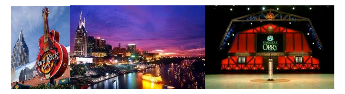
Figure 3. Nashville "Music City" attractions.

Nashville's most famous attractions are directly music-related. Music is the ribbon that weaves the city together, intertwining history, arts, culture and sports into one dynamic cultural package. From gospel spirituals and bluegrass to modern pop and blues, Nashville is "Music City." The downtown area of Nashville features a diverse assortment of entertainment, dining, and cultural and architectural attractions. The Broadway and 2nd Avenue areas feature entertainment venues, nightclubs and a variety of restaurants. Nashville's attractions (Fig. 3) include Music Row, Honky Tonk Highway, Ryman Auditorium, Opryland, Sommet Center, Bluebird Cafe and more. They can be reached by public transportation or short taxi rides from the Hutton Hotel.