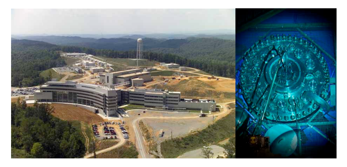
Figure 1. Spallation Neutron Source and High Flux Isotope Reactor at Oak Ridge National Laboratory.