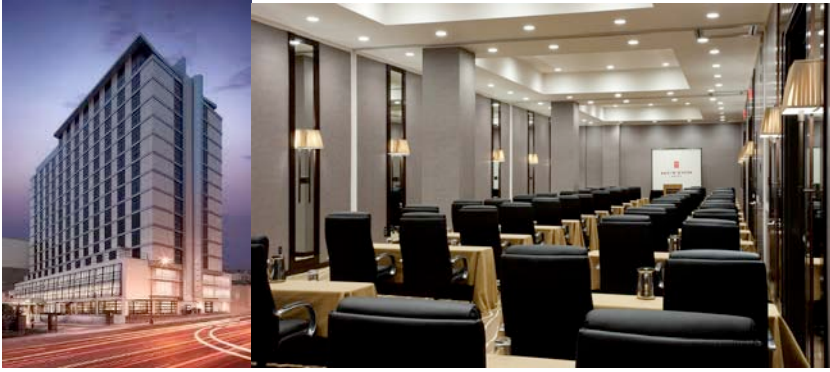
Figure 2. Hutton Hotel, Nashville, TN.