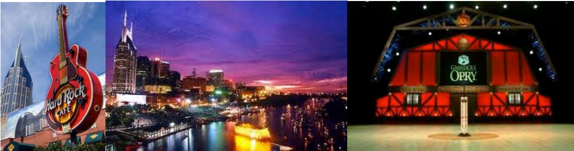
Figure 3. Nashville “Music City” attractions.

Nashville’s most famous attractions are directly music-related. Music is the ribbon that weaves the city together, intertwining history, arts, culture and sports into one dynamic cultural package. From gospel spirituals and bluegrass to modern pop and blues, Nashville is “Music City.” The downtown area of Nashville features a diverse assortment of entertainment, dining, cultural and architectural attractions. The Broadway and 2nd Avenue areas feature entertainment venues, nightclubs and a variety of restaurants. Nashville’s attractions (Figure 3) include Music Row, Honky Tonk Highway, Ryman Auditorium, Opryland, Sommet Center, Bluebird Cafe and more. They can be reached by public transportation or short taxi rides from the Hutton Hotel. The Hutton Hotel also provides a shuttle service to downtown locations on request.